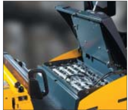
Foldable battery cover