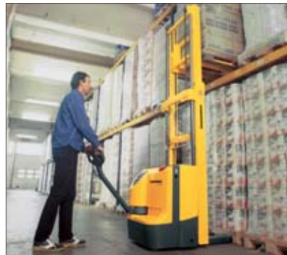
Stacking with EJC Z14

Space-saving through crawl speed button: to reduce the turning radius, the separate