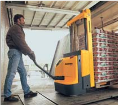
Travel over loading ramp with EJC Z