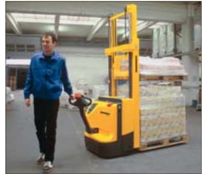
Doubledeck transport of two pallets

tiller switch also facilitates manoeuvring with the tiller in upright position.