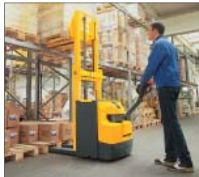
Comfortable during stacking and retrieval

All lifting and lowering functions are effortlessly controlled from the tiller head. This eliminates an awkward reaching round to levers on the truck chassis – compared with traditional trucks. Jungheinrich proportional hydraulics ensure here the sensitive control of the lowering speed – a great advantage, for example, for precise and soft depositing of loads on racking shelves.