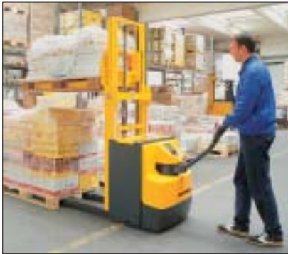
Superior in every travel situation