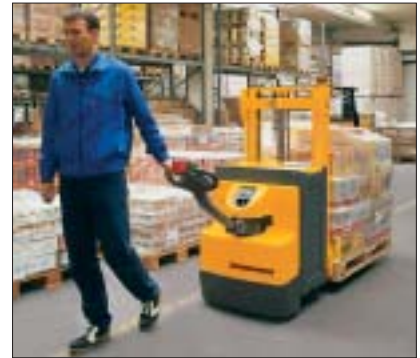
Stable also during cornering

The sprung, hydraulically cushioned support wheels are hydraulically linked. This system actively distributes the stabilising