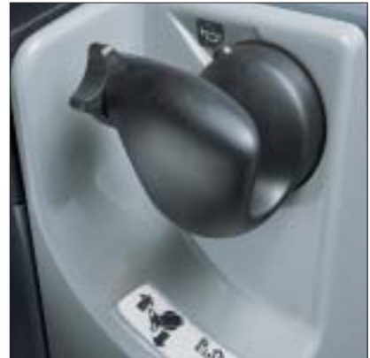
Operating module: travel and hydraulics