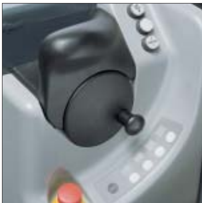
Operating module: steering

During lowering, energy is fed back into the battery – “regenerative lowering”. The energy is also fed back into the battery during braking – “regenerative braking”. The energy reclaimed in this way is available for subsequent energy consumption. The advantages: