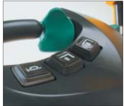
Buttons for sensitive lifting and lowering as well as horn

Jungheinrich-ProTrac optimises traction on the drive wheel. A spring cushioned system in the support wheel prevents the drive wheel from skidding on uneven floors. ProTrac provides stability on all four wheels during stacking and retrieval through hydraulic lock-