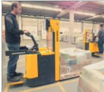
Retrieval with the ERC

All lifting and lowering functions are comfortably controlled from the tiller head without the need to turn round. Here the Jungheinrich Proportional Hydraulics facilitate sensitive control of lifting and lowering speed – essential for precise and gentle depositing of loads in the racking or exact positioning of the load for stacking in. In confined spaces, stand-on platform and side guards are simply folded in and the ERC is used in pedestrian mode. The low height of the platform ensures easy mounting/dismounting.