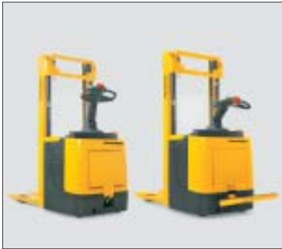
ERC 212 with stand-on platform folded up/down